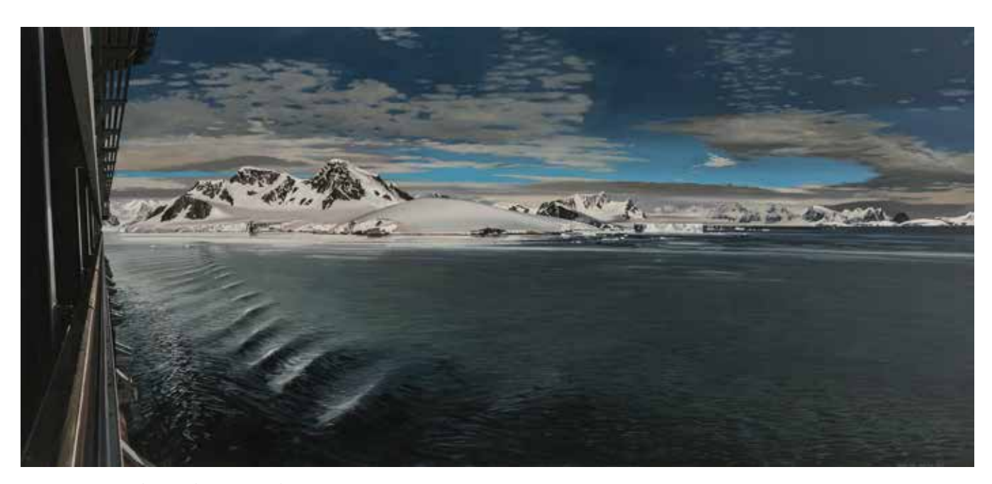
Antarctica II, 2007. Oil on panel, 263/8 × 57 inches

Gap, and Dignes. Takes a small train to Nice on a "bumpy, but beautiful train trip" through mountains.