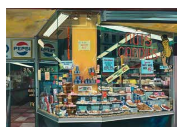
The Candy Store, 1969. Oil and acrylic on linen, 48 × 687/8 inches. Whitney Museum of American Art, New York, purchase, with funds from the Friends of the Whitney Museum of American Art, 69.21

1970 Whitney Museum of American Art includes his works in its key 22 Realists exhibition. Curator James Monte questions Estes about his technique of applying "a loose drawing in paint in rather neutral color which ends in a complete tonal representation of the subject . . ." Estes explains, "Beginning loose and tightening up as I go along is really much faster than attempting to achieve a preliminary hard pencil rendering."