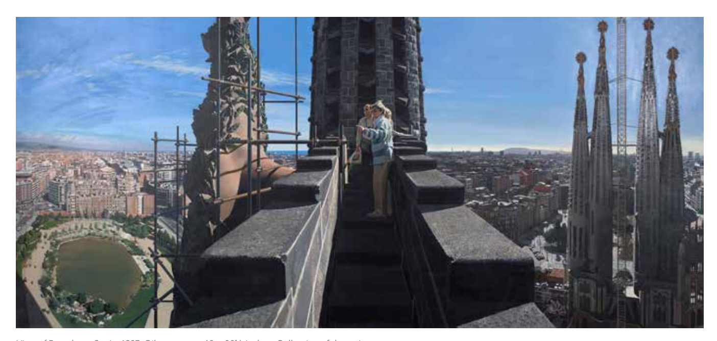
View of Barcelona, Spain, 1987. Oil on canvas, 40 × 881/2 inches. Collection of the artist